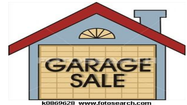
Exhibit Hall, Myrtle Beach Convention Center Admission to South Caro- lina's largest Garage Sale is FREE

//////////////////////////////////// 2010 S.C.'s Largest Garage Sale 7:00 a.m. to 2:00 p.m., Satur- day, August 14, 2010